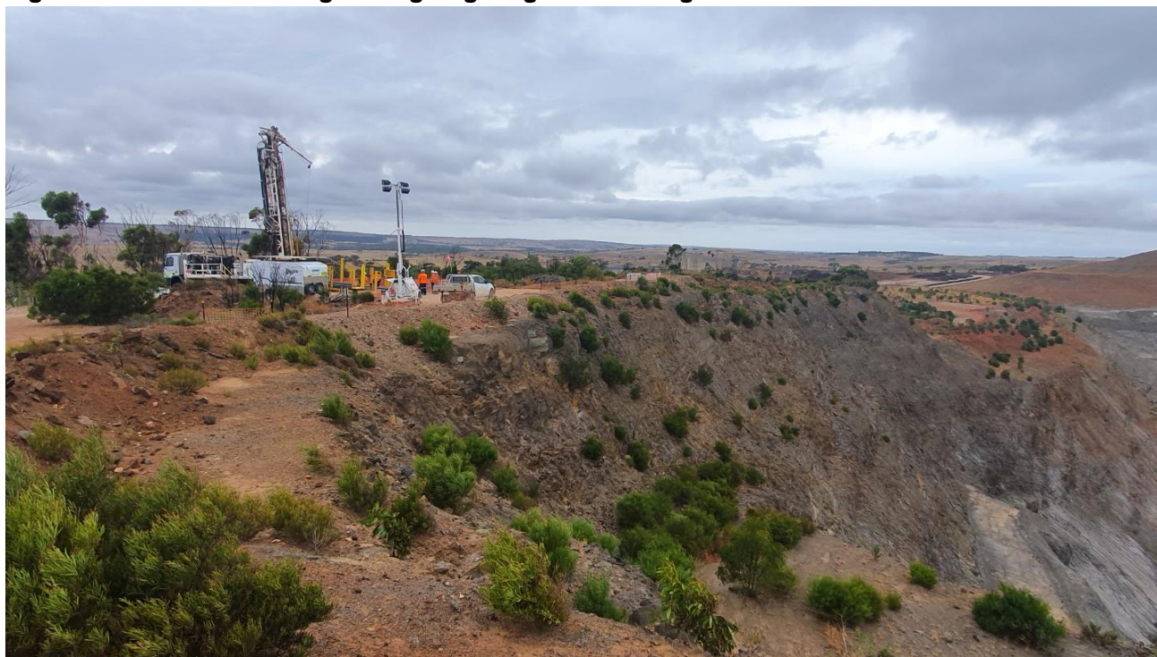
Figure 1 Commencing drilling targeting the Kavanagh lodes below the Giant Pit

The 2020 drilling program successfully intersected a number of high grade Cu-Au zones and the 2021 drill program is aimed to demonstrate the down-dip continuity of the Kavanagh high grade zones (Figure 2) and if successful, to allow a further increase to the Mineral Resource Estimate (which in 2020 more than doubled the total estimated copper metal in the Resources below the open pits 1 ). The recent successful placement which resulted in tranche 1 proceeds of $2.4 million being received in December 2020 2 has enabled the Company to confidently fast-track the drilling program.